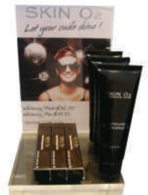
Teeth Whitening Starter Pack