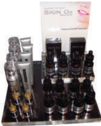
Advanced Skincare Starter Pack