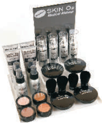
Makeup Starter Pack