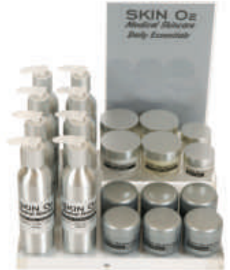
Daily Skincare Starter Pack