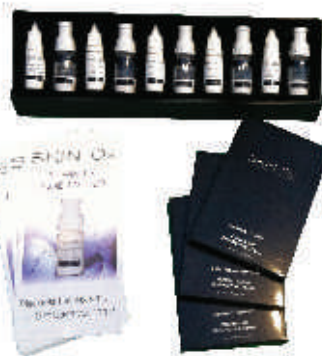
10 Minute Liquid Facelift Starter Pack