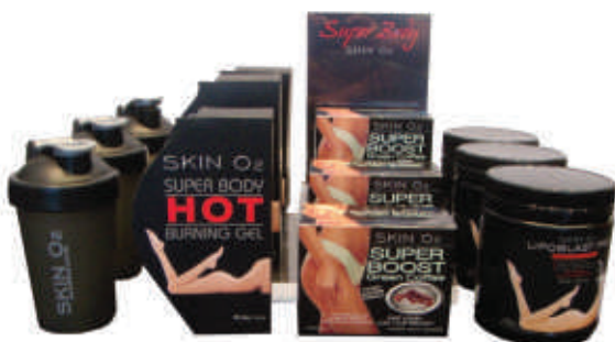
Superbody Starter Pack