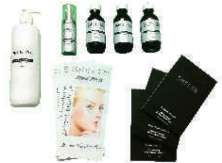
Medi Peels Starter Pack