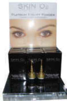
Platinum Eye & Face Lift Starter Pack