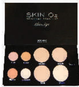
Mineral Makeup Display Kit