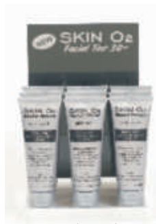
Facial Tint 30+ Sunscreen Starter Pack