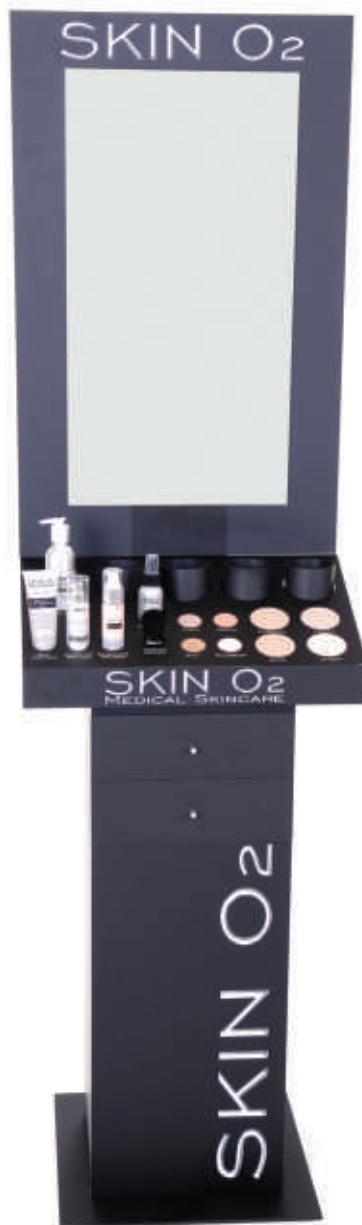
Large Makeup Display Stand