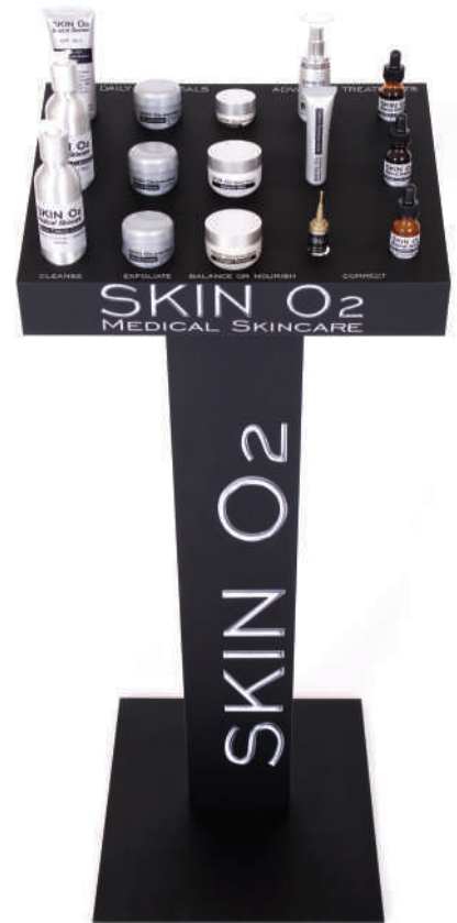
Large Skincare Display Stand