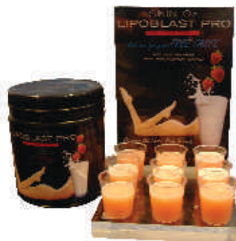
Lipoblast Starter Pack