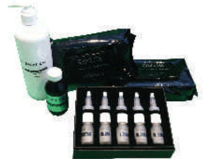
Infusion Serum Starter Pack